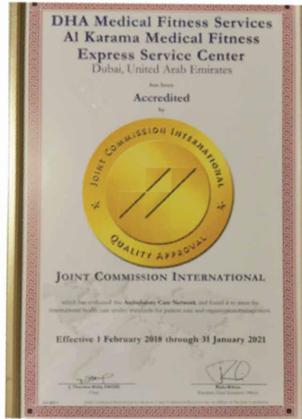
Quality Approval Certificate